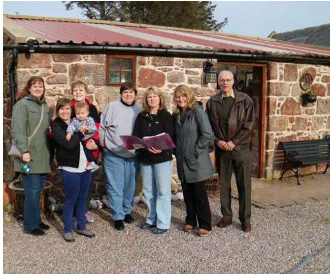
The Nethermill on the old Auchmedden Estate

Moving down along the coast, we were introduced to the Nethermill, which was called the Auchmedden Mill until just after the Rising of '45, when