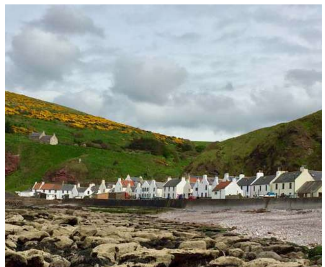
Pennan, the fishing village that was part of the Auchmedden estate