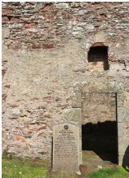
Entrance to the Baird Aisle at St. Drostan's Kirkyard