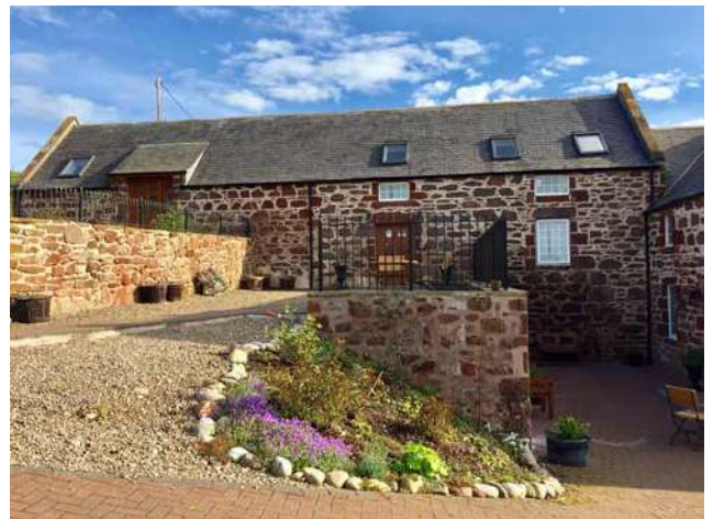
The Nethermill, once called the Auchmedden Mill

Pennan is the fishing village that was part of the Auchmedden estate and under the protection of the Bairds, for many centuries. It remains a small fishing village, and was the site of the movie "Local Hero" starring Burt Lancaster, back in the 1980's. The famous red phone box remains on the Quay, just as it was in the movie, and we all had our picture taken with it, of course. The Pennan Inn is also open and would be an excellent place to stay, should anyone decide to visit.