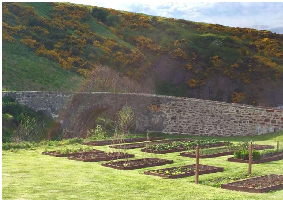
Stone bridge that was built half by the Bairds and the other half by the Frasers at the Nethermill.