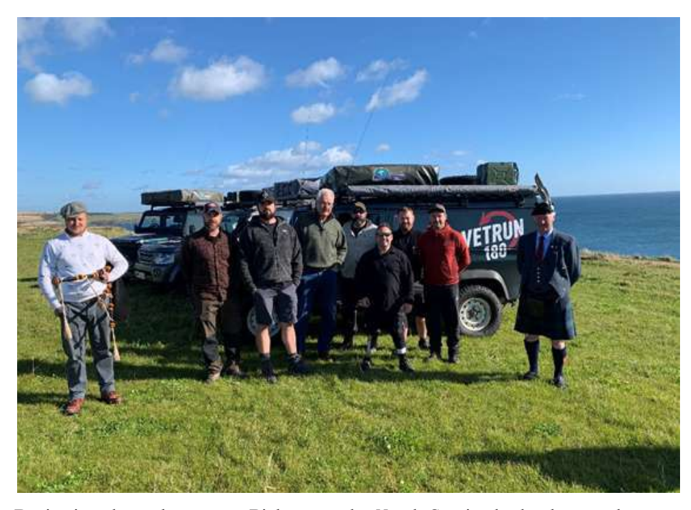
Beginning the trek to cross Rickarton, the North Sea in the background

veterans on challenging expeditions around the world, to re-invoke the sense of adventure and teamwork. We provide 'adventure therapy' and a simple concept has proven itself by the testimonies from the veterans we have helped. During and after an