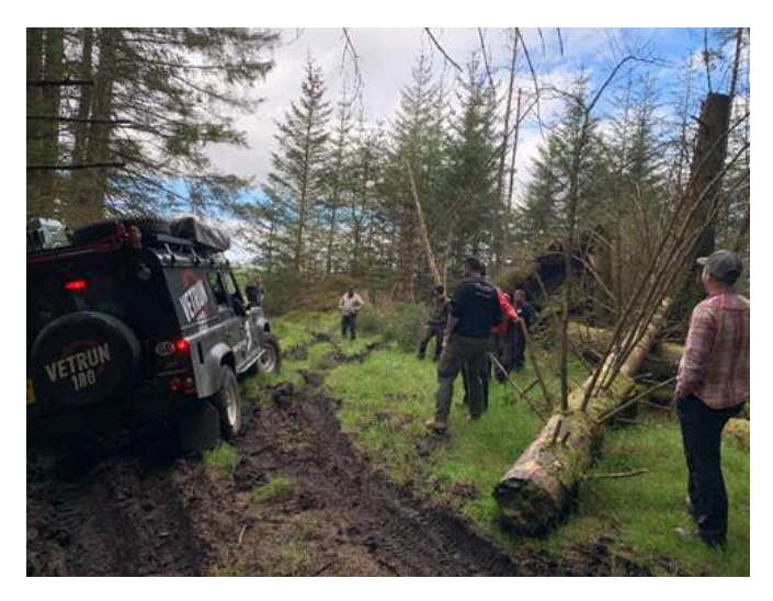
Not long after starting, they bogged down in a wet track, as well as had to remove a large tree from the road. A good strong challenge right away helped the fun begin.