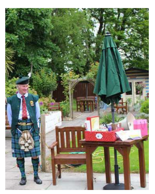
Clashfarquhar House ladies' 90s Club (all over the age of 90!) wrote a doric poem called "Lockdoon", and included it in the Friendship Booklets they made.