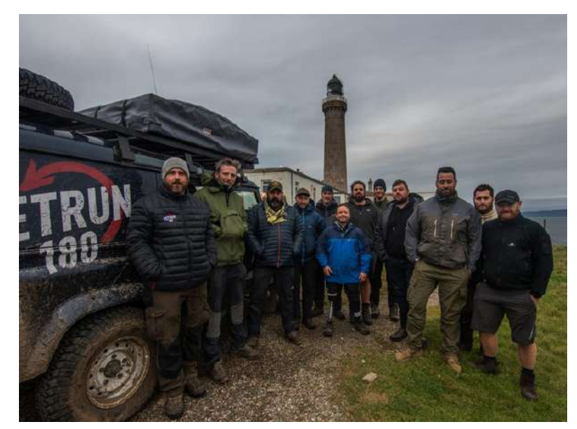
Ardnamurchan lighthouse on the Atlantic