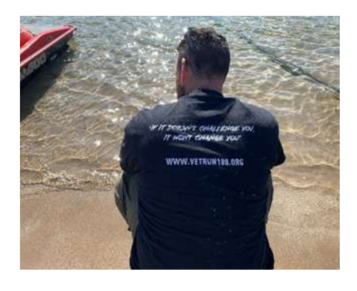
Feet in the North Sea at Stonehaven, and they are off!

VetRun180 is a charity that works with all veterans around the world. Their mission statement outlines what they are about: "VetRun180 is a Charity that takes physically and mentally injured