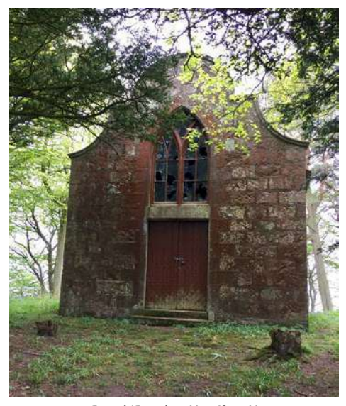
Baird/Barclay Houff at Ury

Also, we are looking into working on the Baird/Barclay Houff at Ury, which is also a long-standing burial ground of Bairds.