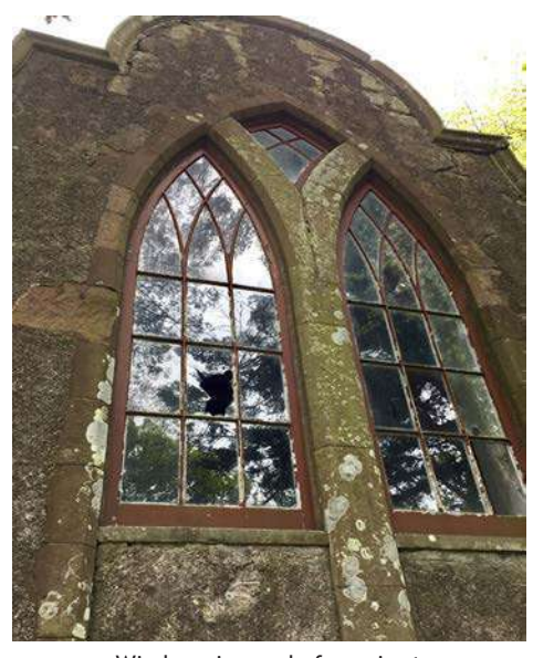
Windows in need of repair at Baird/Barclay Houff at Ury