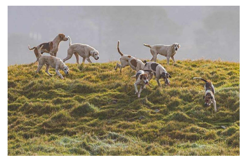
The hounds at Rickarton Estate

Clan Baird Society Worldwide Foundation, Inc. Established April 28<sup>th</sup>, 2020