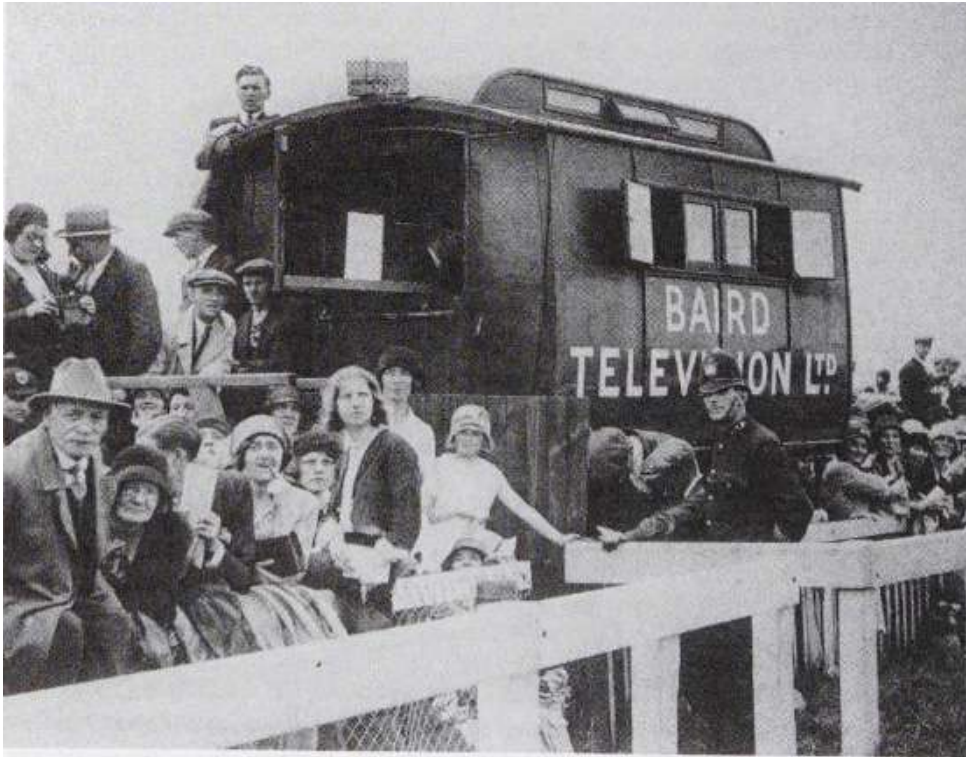
The caravan on Derby day, 3 June 1931.

Tests with a mirror drum in ordinary daylight were carried out at street level in front of