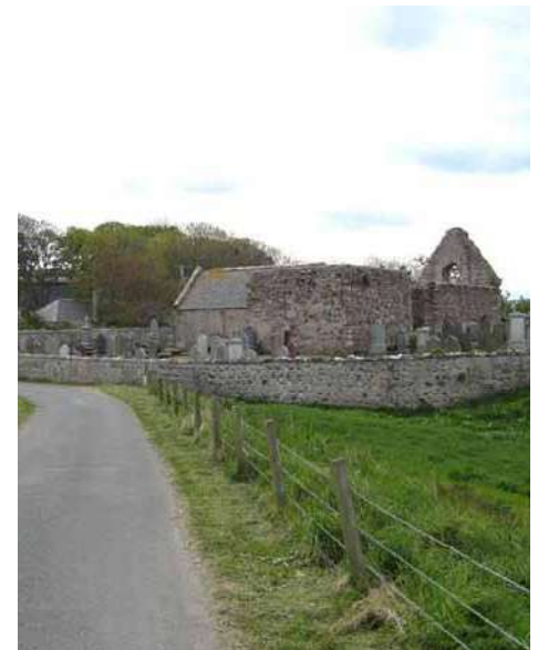
St Drostan's Kirkyard, New Aberdour, Scotland