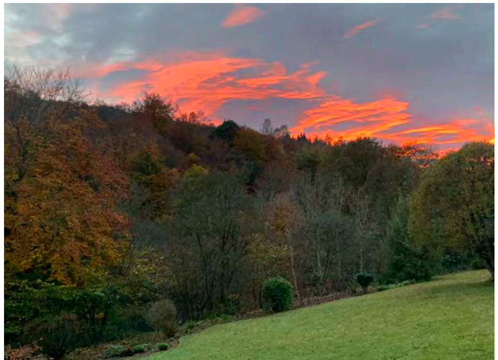
"November sunset at Rickarton House