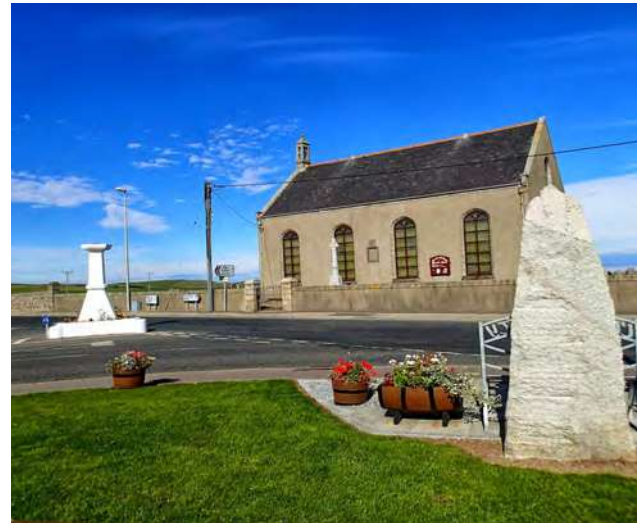
New Aberdour Parish Hall