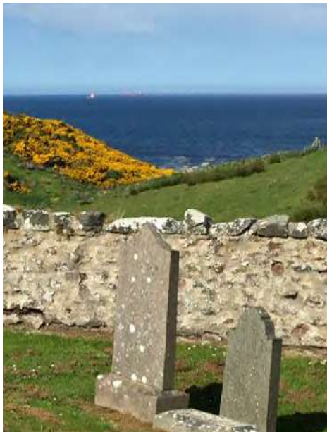
View from Auld Kirkyard

Most of the group agreed that a heritage area would be very beneficial, local ar-