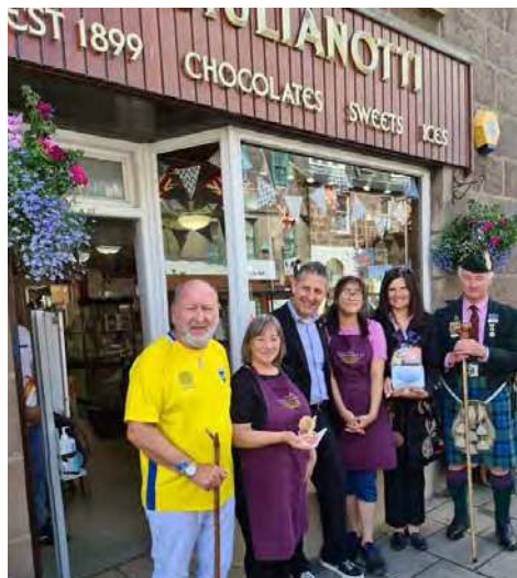
Enjoying some ice-cream at Gulianotti's