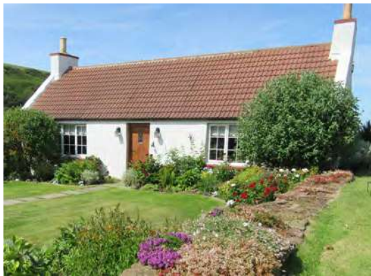
The cottage as it is now, after the renovation.