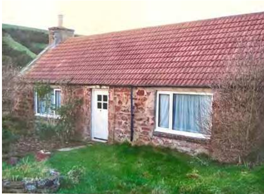
Nethermill cottage before the renovation.

In August, Bill and Lynn Pitt celebrated the 300th anniversary of their cottage (formally the miller's cottage at Mill of Auchmedden). Part of the celebration included planting two Red Elder trees by our daughter Jen and grand-daughter Olivia to commemorate the 300 year anniversary. There is a date stone located on the gable wall of the cottage.