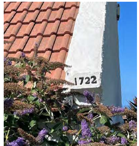
The date stone located on the gable wall of the cottage.

One of the more intriguing features we found during the renovation was another window which had a wooden lintel. The lintel appears to be made from part of a keel (frame) of wooden fishing boat. Note the slightly rounded or arched contour of the lintel.