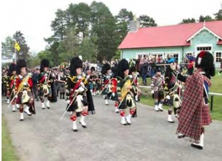
Mass bands at the Braemar Gathering 2022