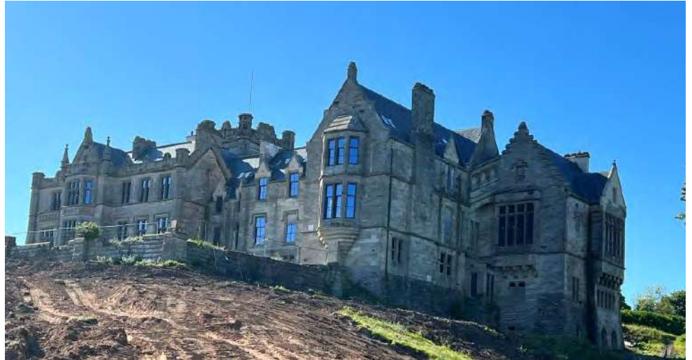
Ury House, originally a Baird home, but now undergoing renovations for use as private apartments.