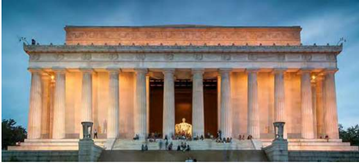
The Lincoln Memorial, Washington DC