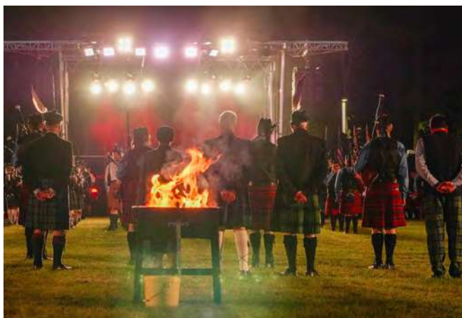
Evening ceremony at Fergus Highland Games.