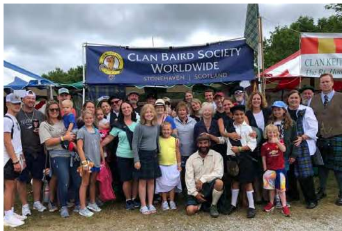
The gathering of Bairds at Grandfather Highland Games