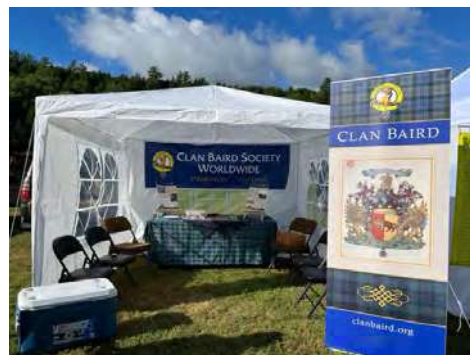
Baird tent at the Quechee Highland Games