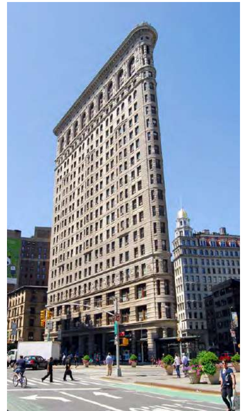
The Flatiron in New York City