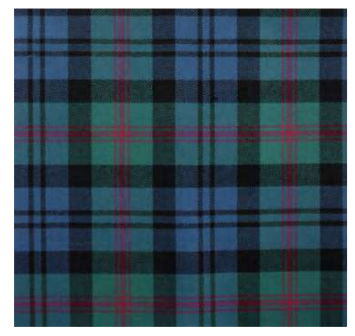
The Ancient Baird Tartan

names. In 1842, two men, posing are descendants of Bonnie Prince Charlie, solidified the world's imagination of the Clan Tartans when they wrote the book Vestuarium Scoticorum.