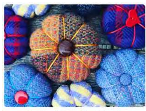
Haptic & Hue

Tartan is much more than a pattern... It can represent the establishment and the power of the state, and at the same time signify rebellion and treachery. It can be an emblem of enslavement and oppression, or it can represent comfort, family, and home. Its meanings are as diverse as its many patterns.