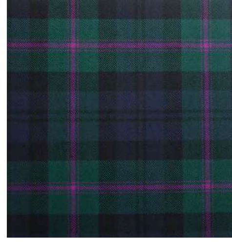
The Modern Baird Tartan

Tartan documentation began in the 1800s with some dubious start. The first identification of Tartan was Wilsons of Bannockburn who during the 1700s began to assign town names and family names to tartan. In 1815, The Highland Society of London began to request Clan Chiefs send samples of their tartans and many Clan chiefs simply didn't know or relied on Wilson. By 1819 Wilsons' Key Pattern Book of 1819, some 250 tartans are included, about 100 of which were given