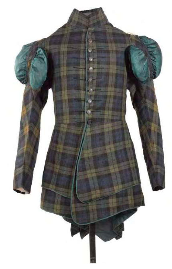
Coat of the Royal Company of Archers, King's Body Guard for Scotland, 1822 (c)