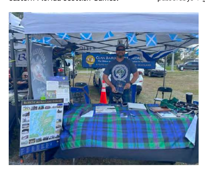
Clan Baird booth at 2023 SouthEast Florida Highland Games, Plantation, Florida

While the rest of the Northern world is deep in the grips of Old Man Winter, those of us who reside in sunny Florida are enjoying beautiful, temperate weather that is perfect for outdoor activities. This was a busy year for the Baird Clan in Florida as it was the first time we were represented at the Central Florida Highland Games on January 14th in the ironically named city of Winter Springs. We then traveled further South to Plantation, Florida on March 4th to take part in the Southeastern Florida Scottish Games.