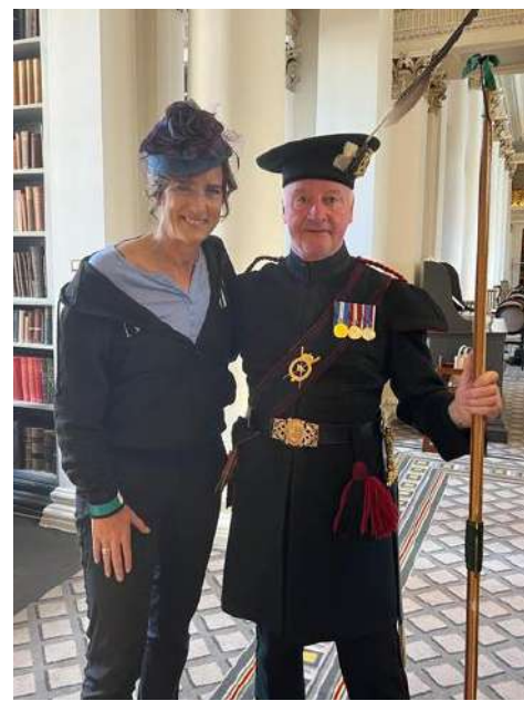
Katherine Grainger, Olympic rower and Bearer of the Elizabeth sword at the Service of Thanksgiving, St Giles Cathedral, on the 5th July