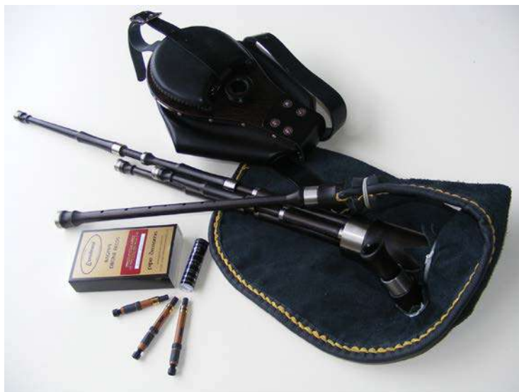
Scottish Smallpipes in the key of A