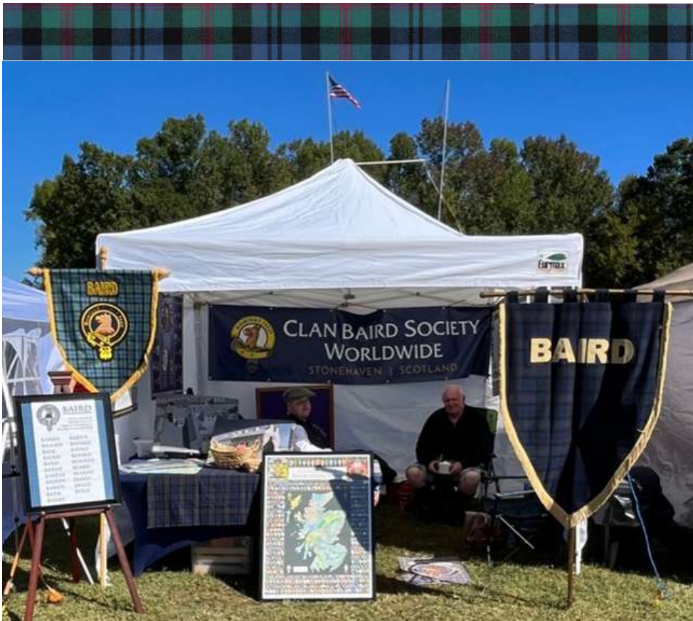
Clan Baird tent at Rocket City Festival, New Market, Alabama, October 7th