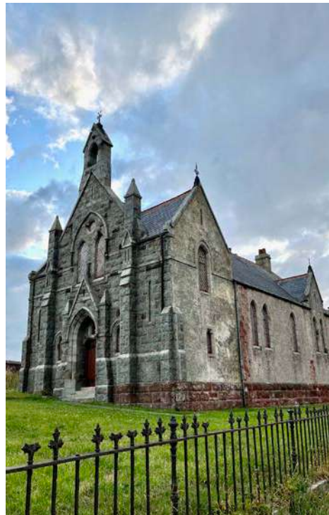
The church at Auchmedden